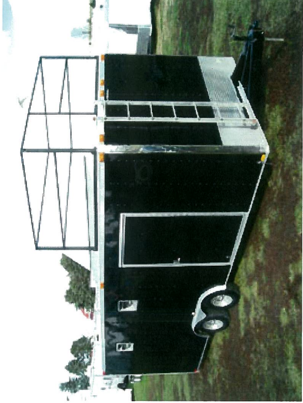
PROPOSED HAZARDOUS MATERIALS RESPONSE/MOBILE COMMAND TRAILER