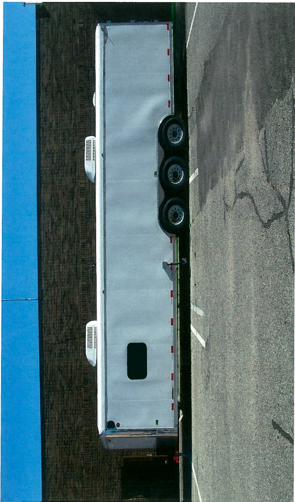
CURRENT HAZARDOUS MATERIALS RESPONSE/MOBILE COMMAND TRAILER